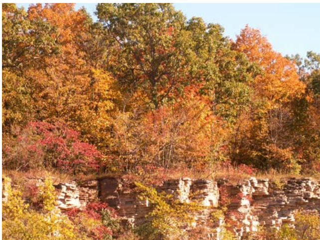
Fall at High Cliff State Park